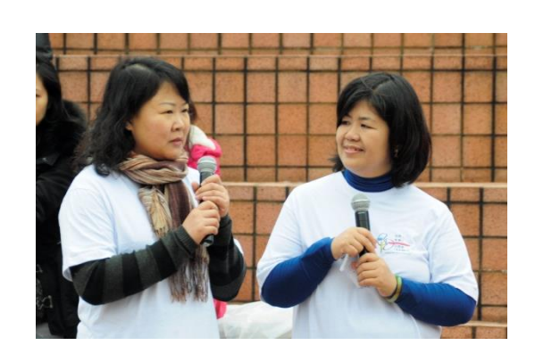
Sister to sister (25 years ago)