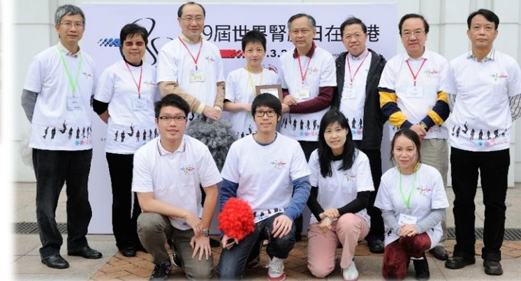
Sponsors of the WKD event