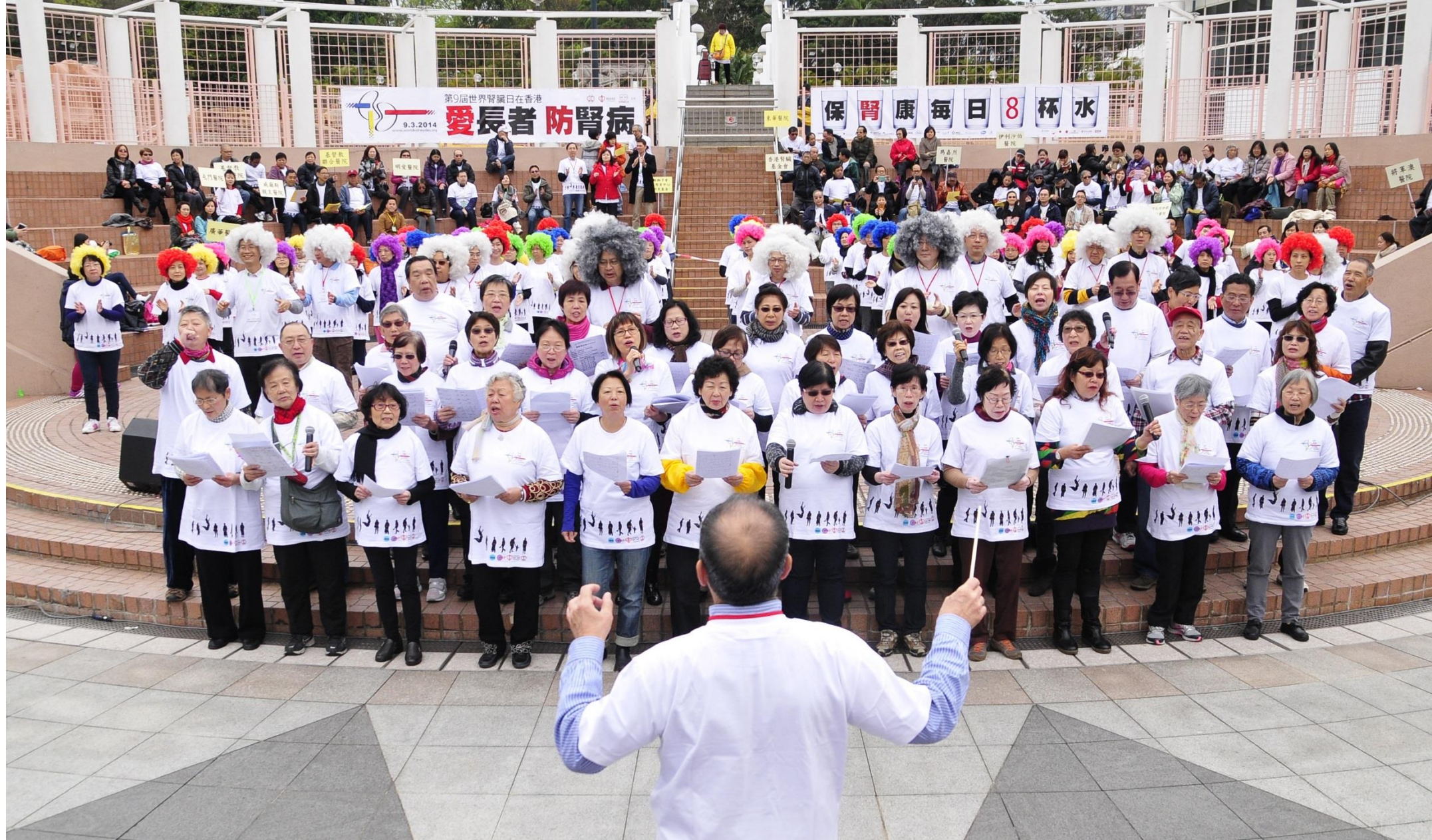
Beautiful Sunday – A song to promote kidney health Singing by Choir from Wanchai Methodist Centre For The Seniors