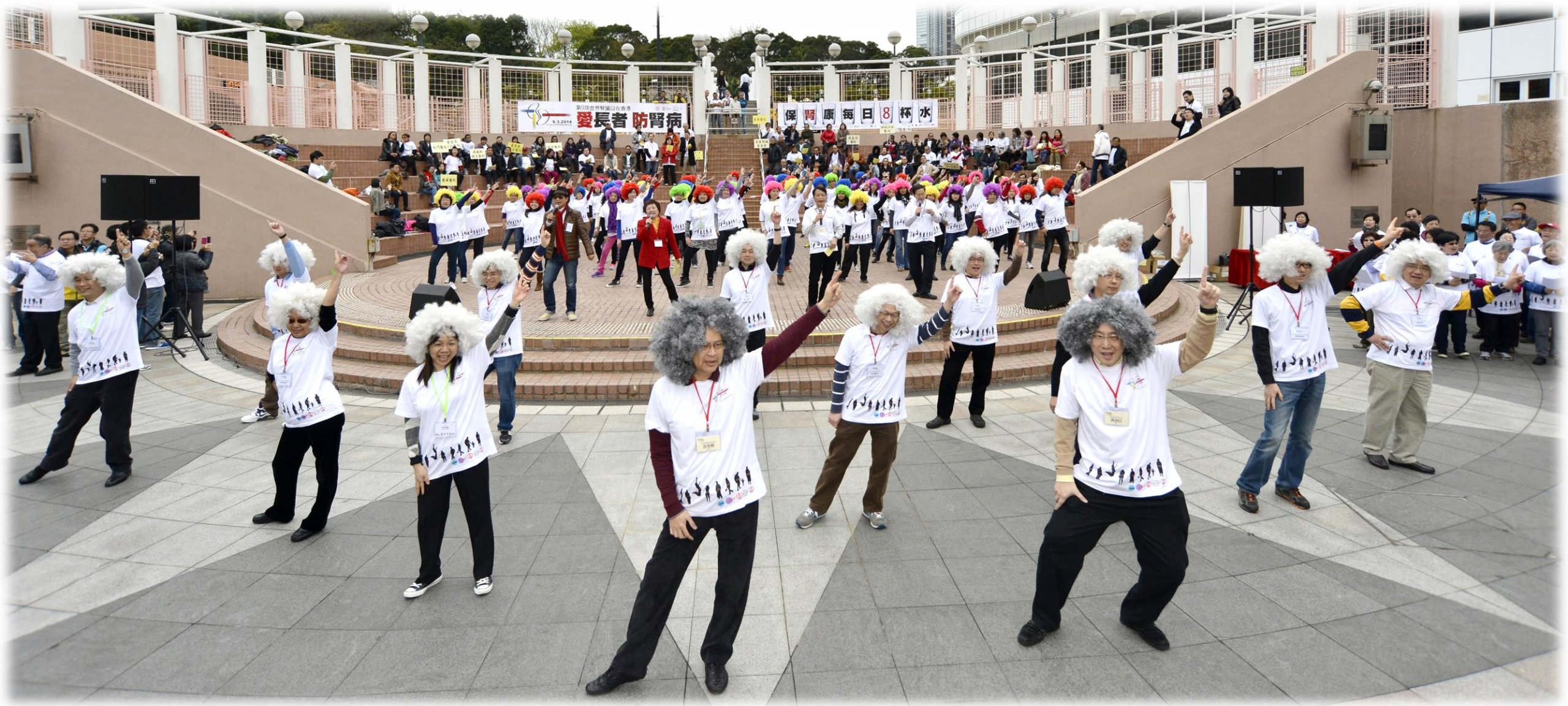
Beautiful Sunday – A song and dance to promote kidney health Singing and dancing by doctors, nurses, healthcare professionals and